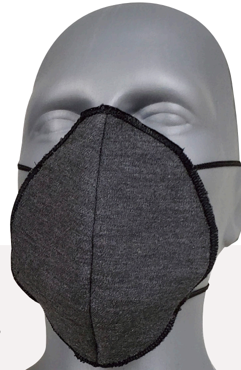
CarbonX Defender Mask 1