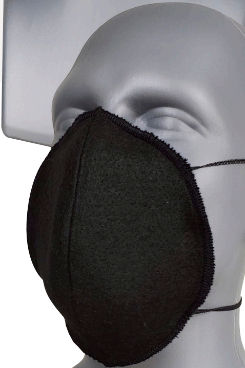
CarbonX Defender Mask 2