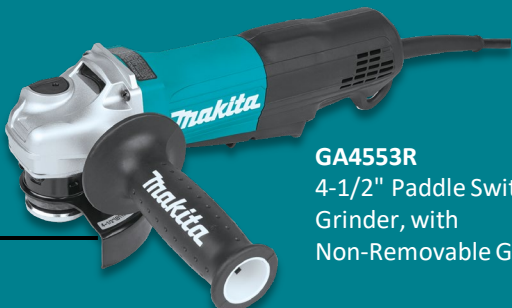
GA4553R 4-1/2" Paddle Switch Angle Grinder, with Non-Removable Guard