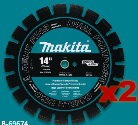
B-69674 14" Diamond Blade, Segmented, Dual Purpose