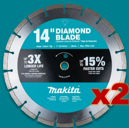
E-01719 14" Diamond Blade, Segmented, General Purpose