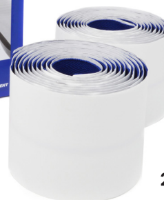
2 Zippers per pack. 3" X 7FT LONG