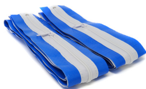
84" L X 3" W BLUE 2 PACK